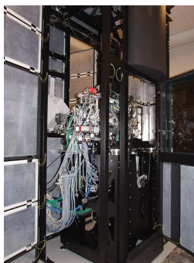
Photos: left: cryo-TEM image of mitochondrion inside a cell.